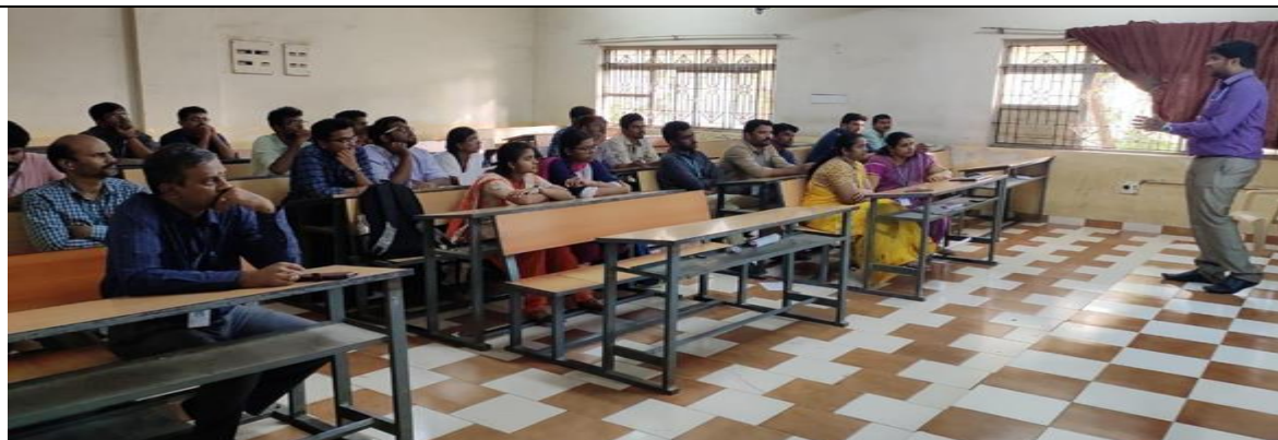
Journal club presentation by Mechanical department staff