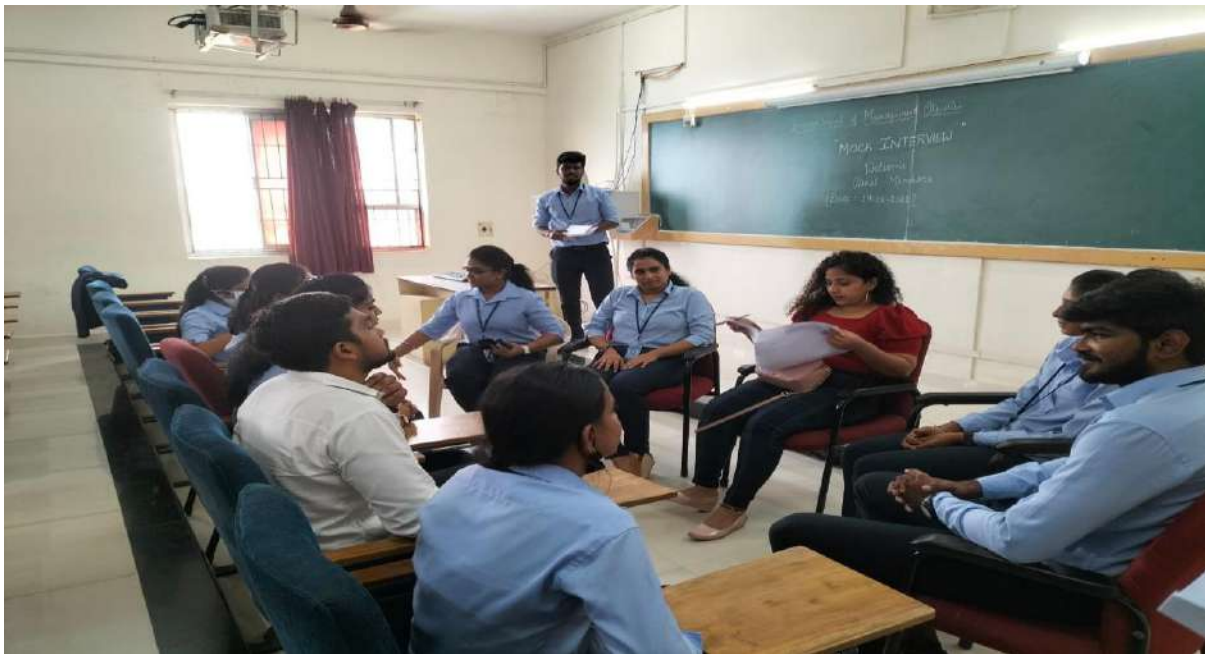
3. ORIENTATION PROGRAMME FOR FIRST YEAR MBA STUDENTS-14-11-2022