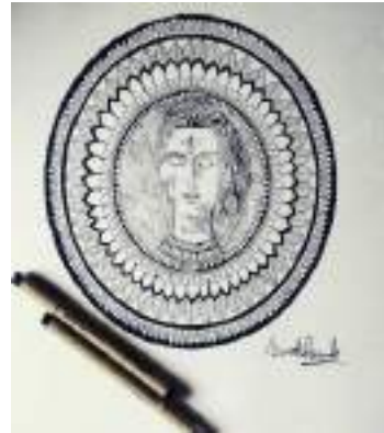
ASWATH RAM A.S- IV A