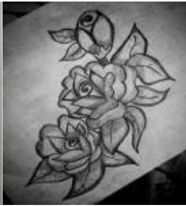
INDUJA.U- III A