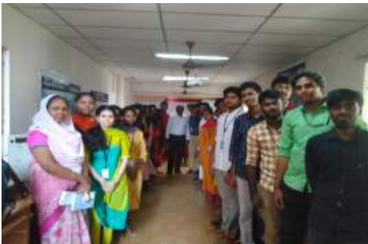
III YEAR B SEC