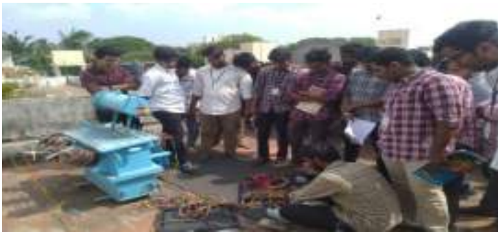
III YEAR A SEC