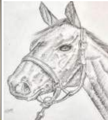
SHREENITHI.V- II B