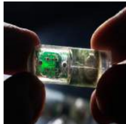
S.SADHANA- II B

The 'Electronic Pill technology' bridges the gap between Engineering and Medicine. It is a tiny capsule-sized electronic device embedded in a pill which uses different components such as drug reservoir, delivery pump, electronic micro controller (MCU), wireless communication and sensors. It has a multichannel sensors which is used in detailed investigation of diseases. After the pill is consumed, it directly reaches the targeted parts of the body. It collects the data and sends it to the computer with 1 meter distance or more. The pill is powered by an edible battery of two SR48 silver oxide (Ag 2 O) battery with 35 hours working capacity and equipped with four different sensors. The sensors are pH Ion Sensitive Field Effect Transistor (ISFET), temperature sensor, dual electrode conductivity sensor, 3-electrode electro-chemical oxygen sensor. These sensors are controlled by Application Specific Integrated Circuit (ASIC). It delivers the real time information to the monitor. Though it has more advantages, it is very expensive and is incapable of detecting radiation abnormalities.