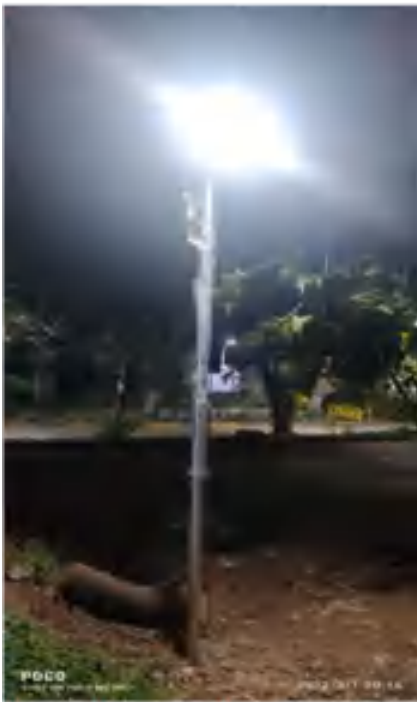
5 Solar street lights funded by management is installed in Easwari engineering college